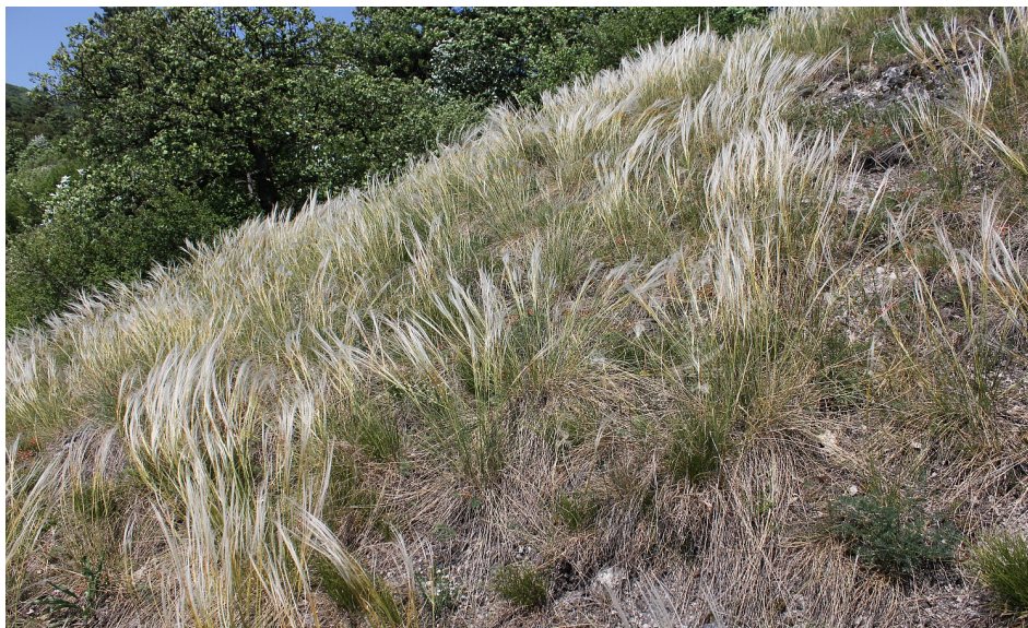
Fig. 2. Stand of the Fumano-Stipetum eriocaulis in the nature reserve “Glaslauerriegel-Heferlberg” near Gumpoldskirchen (Photo: N. Sauberer, 20 May 2012).

On south-facing rocky outcrops, pioneer grasslands can be found, which were described as subassociation (1.2a) Fumano-Stipetum minuartietosum setaceae by KARRER (1985a). This unit, which is only known from two localities (Mödlinger Klause, Hauerberg near Bad Vöslau), was included in TPA cluster 7. Differential species against the typical subassociation (1.2b) are: Seseli austriacum , Hieracium glaucum , Euphorbia saxatilis , Minuartia setacea , Cardaminopsis petraea , Aethionema saxatile , Biscutella laevigata , Erysimum sylvestre .