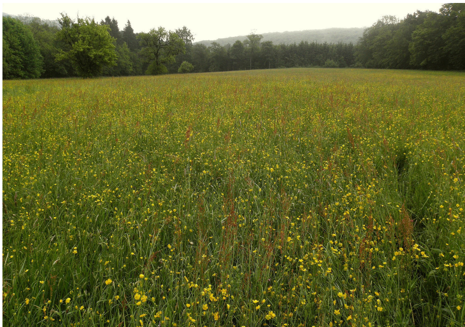
Fig. 9. Stand of the Ranunculo repentis-Alopecuretum pratensis near Mauerbach (Photo: M. Staudinger, 22 May 2010).

In meadows on intermittently wet soils (i.e., with longer wet and short dry phases), Arrhenatherum elatius is usually absent, and Alopecurus pratensis is the dominant grass species (total cover: 20%). Occasionally, Poa trivialis (total cover: 8%) or Holcus lanatus (total