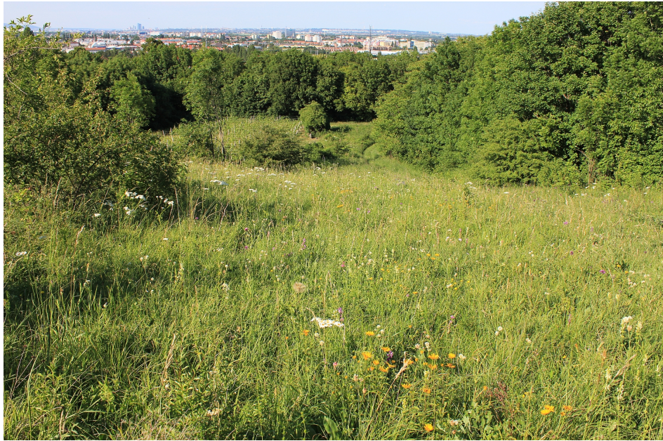
Fig. 5. Stand of the Polygalo-Brachypodietum on the hill Eichkogel near Mödling (Photo: N. Sauberer, 7 June 2012).

Abb. 5. Bestand des Polygalo-Brachypodietum am Eichkogel bei Mödling (Foto: N. Sauberer, 07.06.2012).