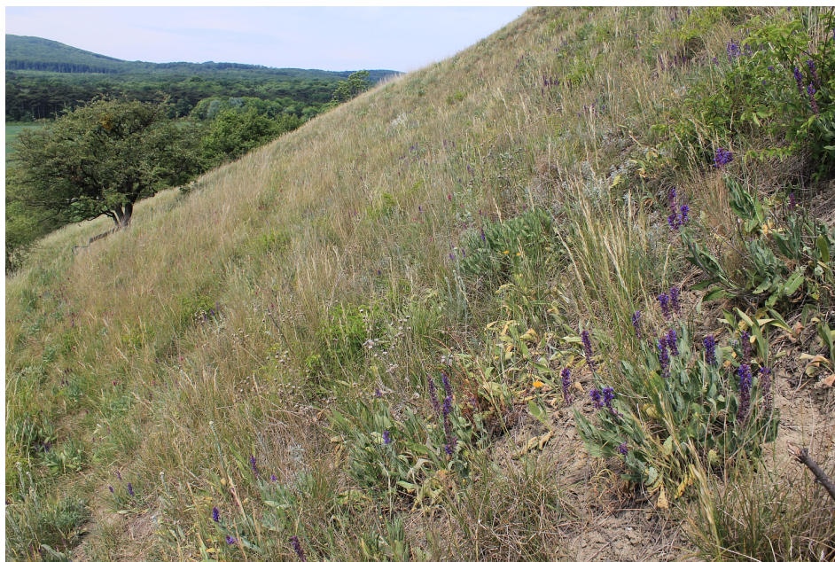
Fig. 4. Stand of the Salvio nemorosae-Festucetum rupicolae on the hill Eichkogel near Mödling (Photo: N. Sauberer, 21 May 2012).

a synonym of the latter by MUCINA & KOLBEK (1993). However, they do not mention the locality Eichkogel in their description of Astragalo exscapi-Crambetum . The numerical classification of a large supra-national data set suggested that these two communities should be treated as separate associations (DÚBRAVKOVÁ et al. 2010). Although we were not able to reproduce this result in our own TWINSpan classification (both types were mixed together in TPA clusters 23f–g, see WILLNER et al. 2013), we accept the Salvio nemorosae-Festucetum rupicolae as a separate unit because Astragalus exscapus and Crambe tatarica are both indicators of disturbed sites (CHYTRÝ 2007: 425) and are absent from the majority of Pannonian loess grasslands. However, a definite solution to this question remains a task for