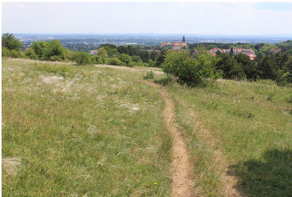
Fig. 3. Stand of the Scorzonero austriacae-Caricetum humilis near Perchtoldsdorf (Photo: N. Sauberer, 28 May 2012).

Bromus erectus 3, Carex humilis 3, Anthyllis vulneraria 2, Dorycnium germanicum 2, Galium austriacum 2, Inula hirta 2, Sesleria caerulea 2, Anthericum ramosum 1, Bupleurum falcatum 1, Genista pilosa 1, Inula ensifolia 1, Leontodon incanus 1, Phyteuma orbiculare 1, Polygala amara 1, Rhytidium rugosum 1, Scabiosa canescens 1, Thesium linophyllum 1, Abietinella abietina +, Asperula cynanchica +, Asperula tinctoria +, Avenula pubescens +, Briza media +, Campanula glomerata +, Campylium stellatum +, Centaurea scabiosa +, Chamaecytisus ratisbonensis +, Daphne cneorum +, Epipactis helleborine +, Euphorbia cyparissias +, Festuca stricta +, Gentianella austriaca +, Globularia cordifolia +, Helianthemum canum +, Helianthemum nummularium subsp. obscurum +, Hieracium pilosella +, Hippocrepis comosa +, Homalothecium lutescens +, Hypnum cupressiforme +, Linum flavum +, Linum tenuifolium +, Pimpinella saxifraga +, Plantago media +, Polygala chamaebuxus +, Potentilla incana +, Prunella grandiflora +, Pulsatilla grandis +, Sanguisorba minor +, Scabiosa ochroleuca +, Scorzonera austriaca +, Scorzonera purpurea +, Senecio jacobaea +, Seseli annuum +, Seseli hippomarathrum +, Teucrium montanum +, Thymus praecox +, Tortella tortuosa +, Vincetoxicum hirundinaria +.