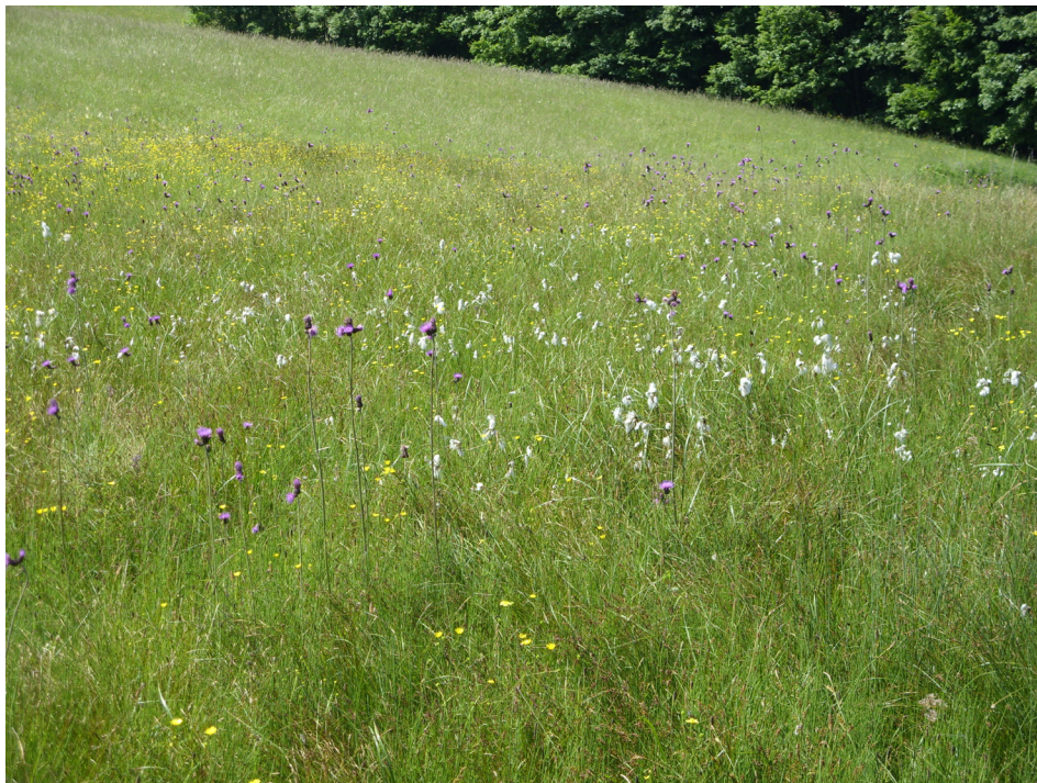
Fig. 10. Meadow with a strong moisture gradient and three different associations: Caricetum davallianae (in the foreground, with the hairy inflorescences of Eriophorum angustifolium ), Cirsietum rivularis (the narrow strip with the yellow flowers of Ranunculus acris ) and Filipendulo vulgaris-Brometum (on the slope behind) (near Wolfsgraben, Photo: W. Willner, 6 June 2010).

In contrast to the previous association, nutrient-rich wet meadows of the Calthion are still relatively widespread in the Vienna Woods. The most characteristic species of these meadows is Cirsium rivulare (total cover 13%). The soil has a good water supply throughout the year, without pronounced phases of drought. Other conspicuous plants of this grassland type are Trollius europaeus and Dactylorhiza majalis , which make the stands very attractive during flowering time. The Cirsietum rivularis corresponds to the TPA clusters 35 p.p. and 54.