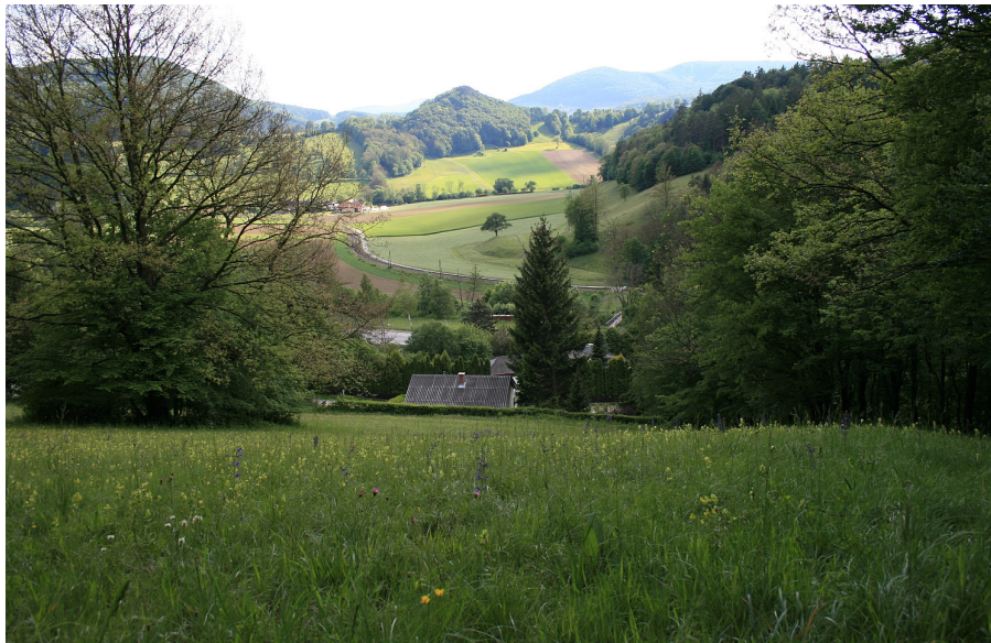
Fig. 7. Stand of the Euphorbio verrucosae-Caricetum montanae in Altenmarkt an der Triesting (Photo: N. Sauberer, 18 May 2012).