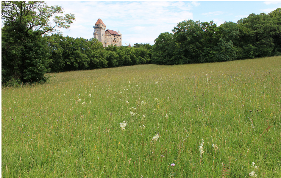
Fig. 6. Stand of the Filipendulo vulgaris-Brometum in Maria Enzersdorf (Photo: N. Sauberer, 8 June 2012).

Abb. 5. Bestand des Polygalo-Brachypodietum am Eichkogel bei Mödling (Foto: N. Sauberer, 07.06.2012).