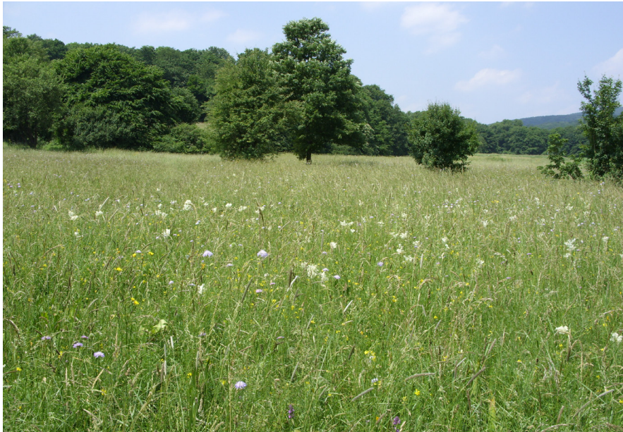
Fig. 8. Stand of the Filipendulo vulgaris-Arrhenatheretum in the Gutenbach valley, Vienna (Photo: W. Willner, 12 June 2010).

Abb. 8. Bestand des Filipendulo vulgaris-Arrhenatheretum im Gutenbachtal, Wien (Foto: W. Willner, 12.06.2010).