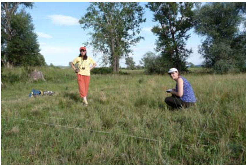
Fig. 5: Alopecuro pratensis-Festucetum pseudovinae (section 3.3, rel. A). Rimavská kotlina basin, Chanava, Slaná river floodplain.