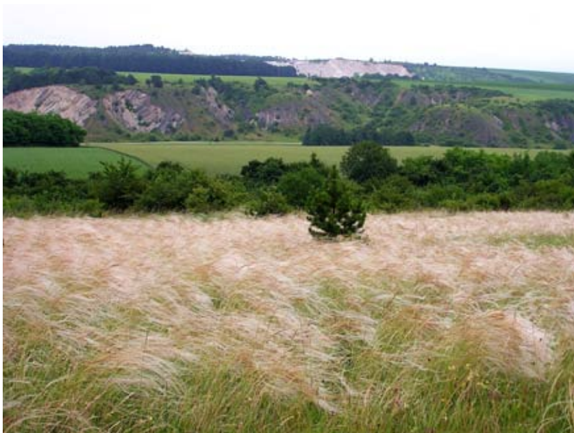
Fig. 4: Dry grassland dominated by Stipa pulcherrima (Table 1, rel. 116). Malé Karpaty Mts., Pod Holým vrchom Nature Reserve. In the background, there are scree slopes with stands of the Poo badensis-Festucetum pallentis (Table 1, rel. 19 and 30).

Abb. 4: Von Stipa pulcherrima dominiertes Trockenrasen (Tabelle 1, Aufn. 116). Malé Karpaty Mts., Naturschutzgebiet Pod Holým vrchom. Im Hintergrund erkennt man Schutthalden mit Beständen des Poo badensis-Festucetum pallentis (Tab. 1, Aufn. 19 and 30) (Foto: D. Dúbravková, 23.6.2006).