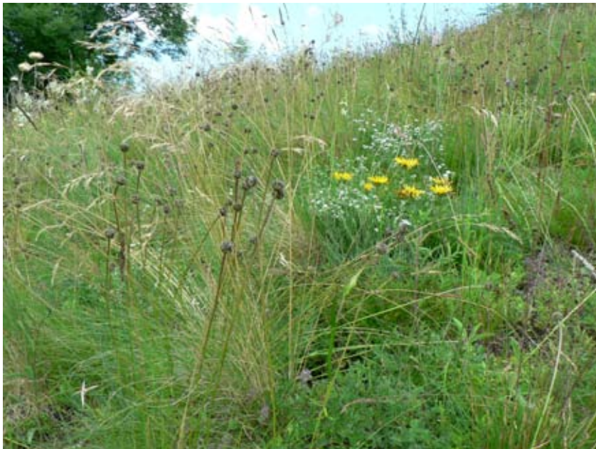
Fig. 2: Astragalo exscapi-Crambetum tatariae (Table 1, rel. 101). Pavlovské vrchy Mts., Šibeničník Nature Reserve.

Dry grasslands on acidic (quartzite) and base-poor volcanic bedrock (Table 1, rel. 105–111) represent transitions between the Festucion valesiacae and the Koelerio-Phleion