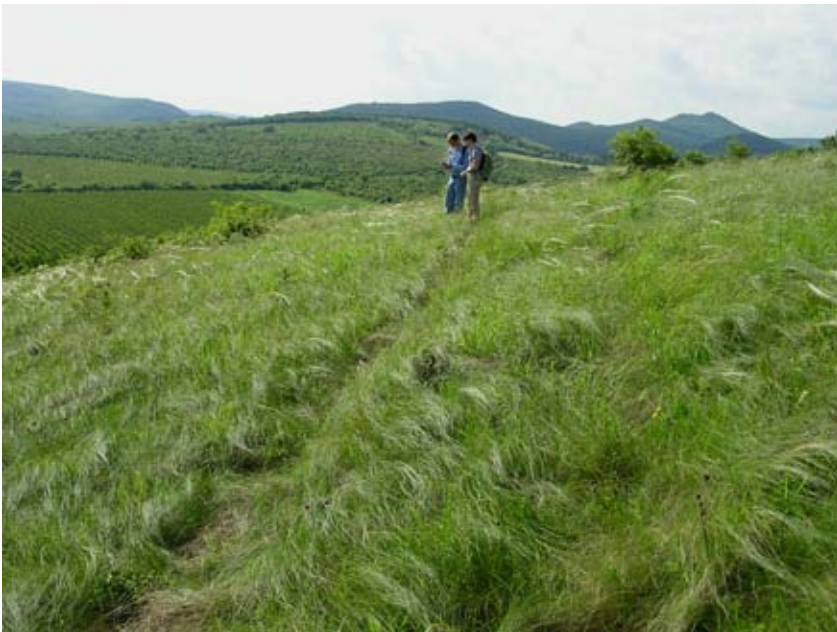
Fig. 3: Stipetum tirsae (Table 1, rel. 112). Börzsöny Mts., Ruzsás-hegy Mt.

Early stages of succession from the Festucion valesiacae towards the Cirsio-Brachypodium pinnati are documented by the relevés 116–118 (Table 1, Fig. 4). Relevés 116 and 117 are dominated by Stipa pulcherrima and most probably represent successional shifted stands